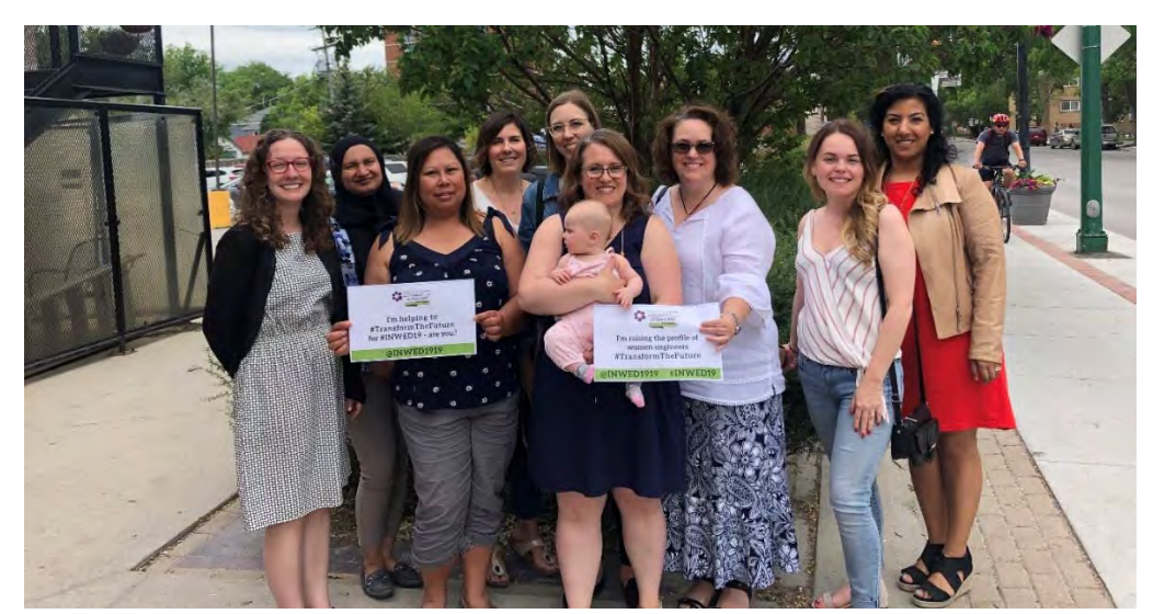
CIPWIE Members Celebrating International Women in Engineering Day (INWED) – June 23, 2019

Beginning in July 2019, CIPWIE will be operationalized under the new Equity and Representation group within Engineers Geoscientists Manitoba – a signal of the Association's commitment to End 5.2 and the Engineers Canada 30 by 30 Goal. Thankyou to all the volunteers that have supported CIPWIE over the years!