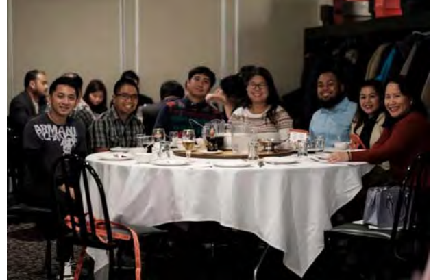
2019 AGM and PD Seminars