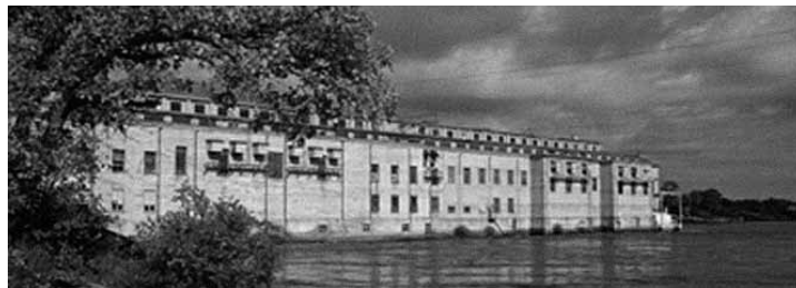
Figure 2: Pointe du Bois Plant

An interesting development occurred in January of 1957, when Manitoba Hydro Electric Board received a letter of intent from