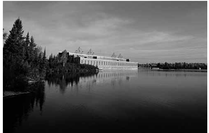
Figure 1: Slave Falls Plant

The settlements in rural parts of the province also wanted to share in the benefits of this new form of energy. It spawned a multitude of