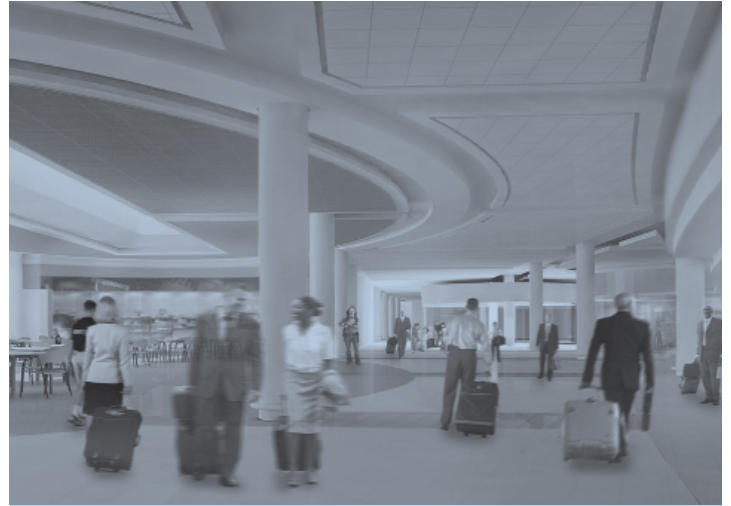
The Town Square Hall

The new terminal building, the most visible part of the redevelopment, will have a grand entrance and will be technology based. Its