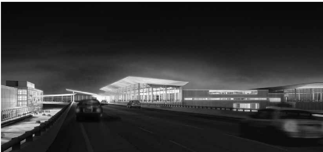
The Terminal Approach View

By the time Bob Edgar's talk ended, it was clear that the WAA is well on the way to achieving its goal, stated in the design definition as "WAA will establish a signature airport site redevelopment design that is consistent with our vision of leading transportation innovation and growth. Unique, striking and outstanding, our terminal structure will reflect our prairie roots and heritage of an important Canadian transportation centre that will continue to play a leading role in the future of this country." ■